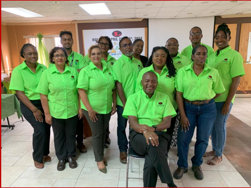
HSE Week 2024