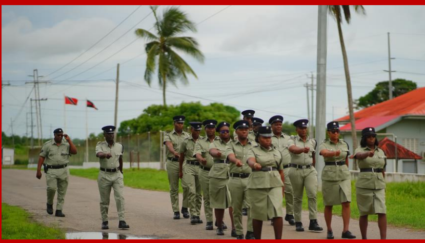
Estate Police - Passing out Parade