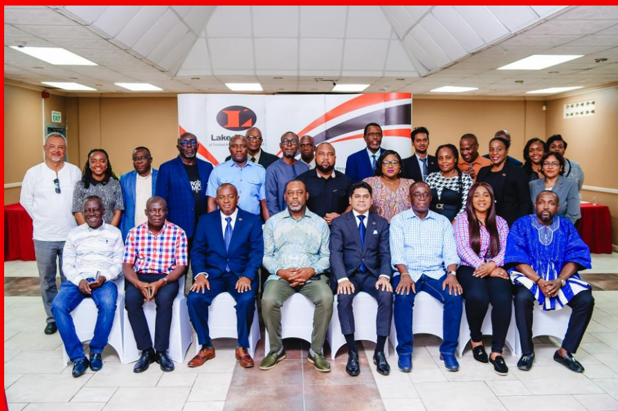
Ghana delegation and Lake Asphalt representatives