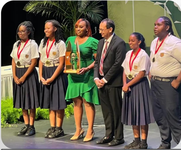
Vessigny Secondary School emerged winner at National Energy's second Energy Sustainability Debate Competition Finals.