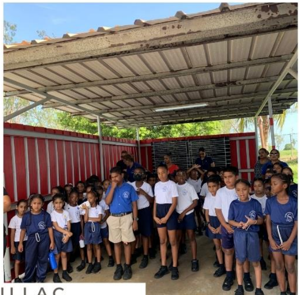
ROUSILLAC PRESBYTERIAN SCHOOL