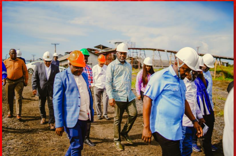
The delegation on tour of the lake and facilities