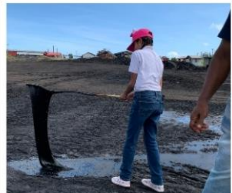
WINDERMERE PRIVATE PRIMARY SCHOOL